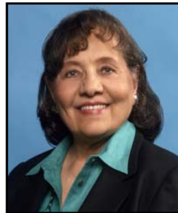
Diane Judith Nash