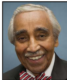
Rep. Charles B. Rangel